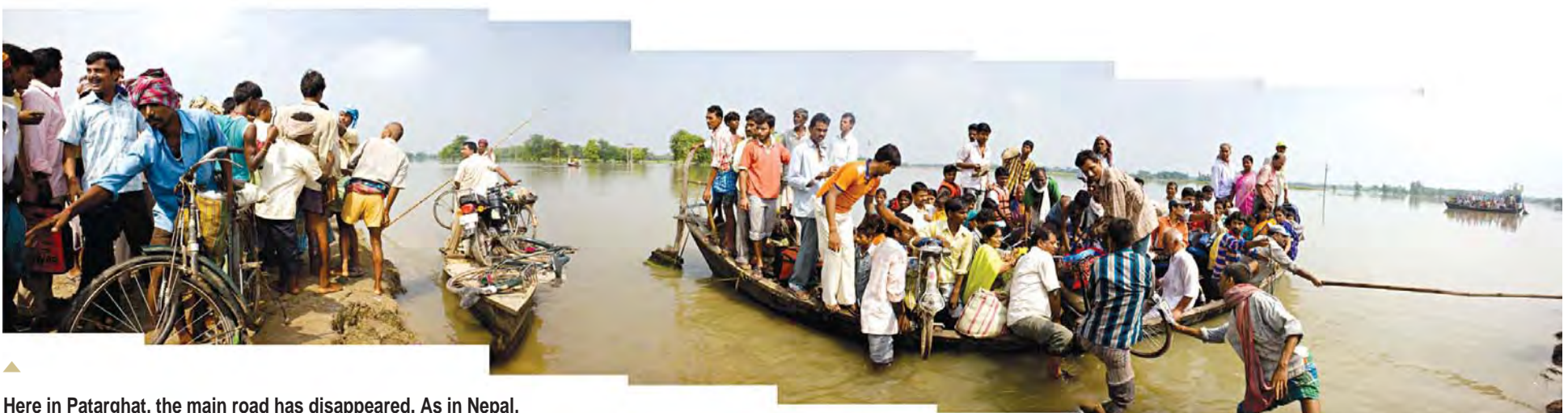
Here in Patarghat, the main road has disappeared. As in Nepal, dangerously overloaded boats help people cross to the other side.