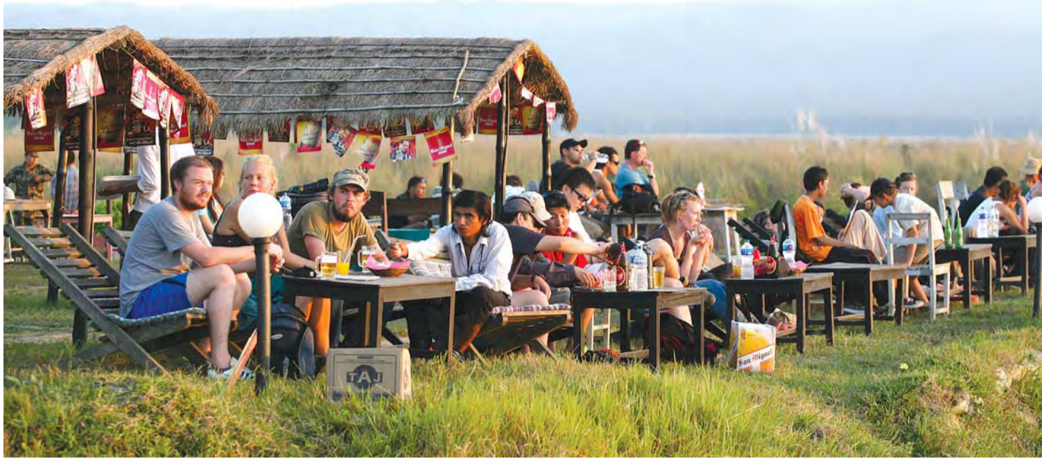
TOURIST TRAP: Tourists in Sauraha on Monday wait to view wildlife at the edge of the Chitwan National Park. There are fears global recession will Nepal's tourism industry.

Nepal's poverty partially cushions us from global recession