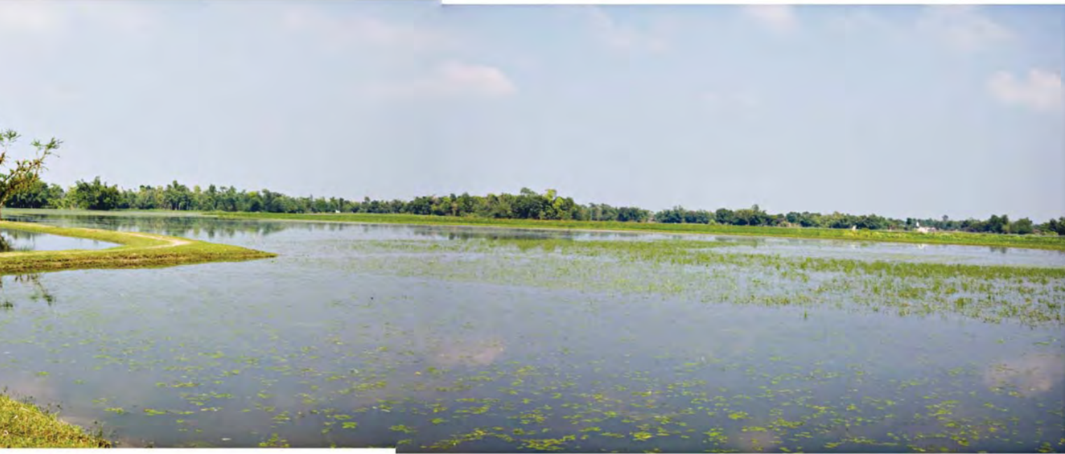
Three months after the waters rose, this is still the only dry patch connecting the village of Galmar to the rest of flooded Mahdepura district.

Bihar is amongst the poorest states in India, eight out of ten people are dependent on agriculture. The Kosi catastrophe is expected to make Bihar even poorer, and force farmers to migrate for work.