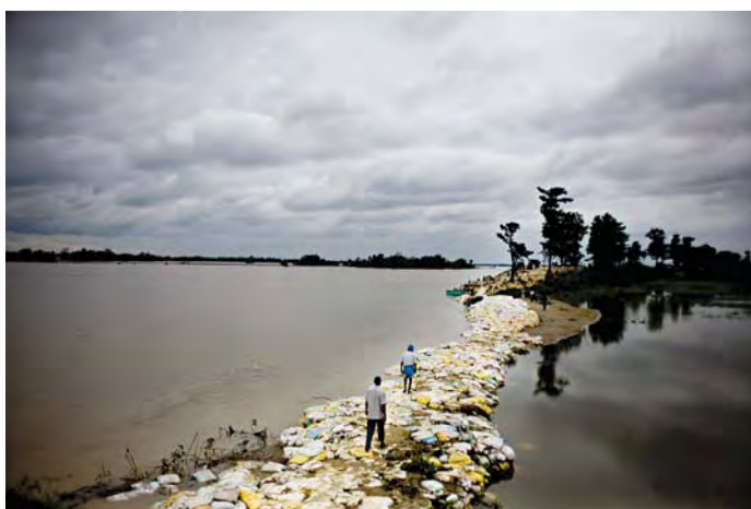
◀ Plugging the breach in Kosi embankment that unleashed havoc in Bihar is proving to be a massive challenge for Indian and Nepali engineers. They are trying to divert the river upstream to its original channel so they can repair the breach.