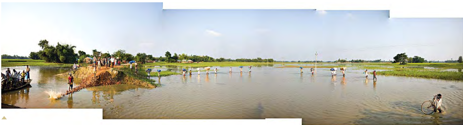
Villages in Nepal and India are cut off from access due to broken bridges and damaged roads. Getting food and medicine is difficult and often requires long travels on many different means of transportation.