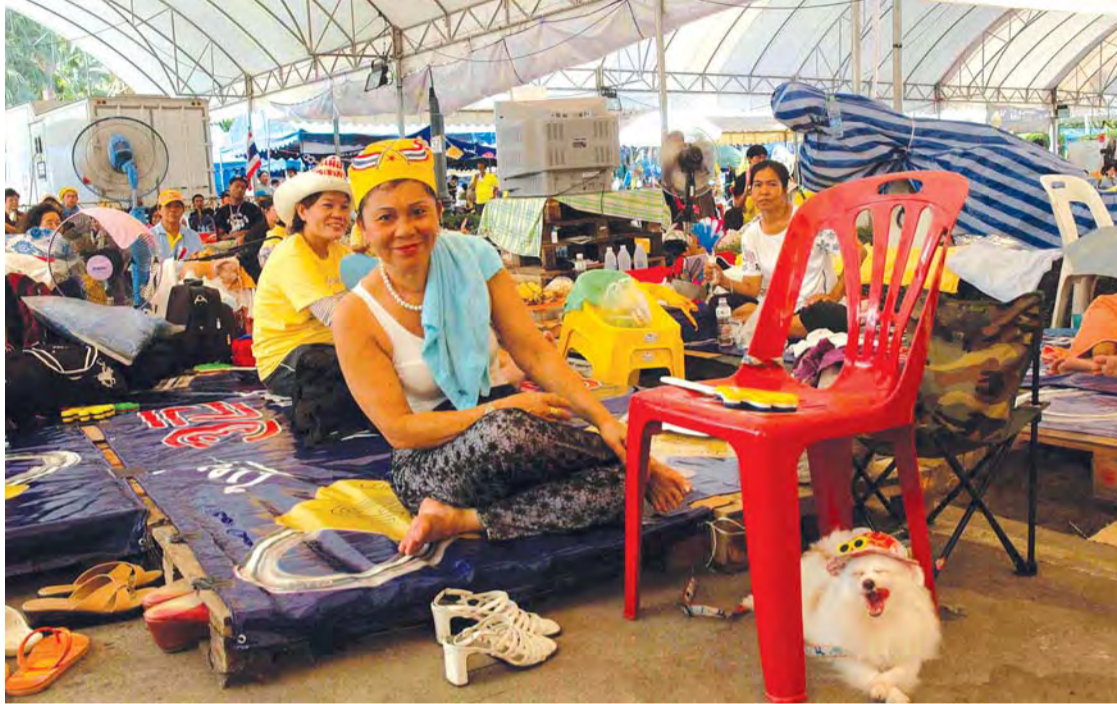
LAP DOG: Protesters at the seize of government homes in Bangkok last week.

People power in Thailand is different from people power in Nepal