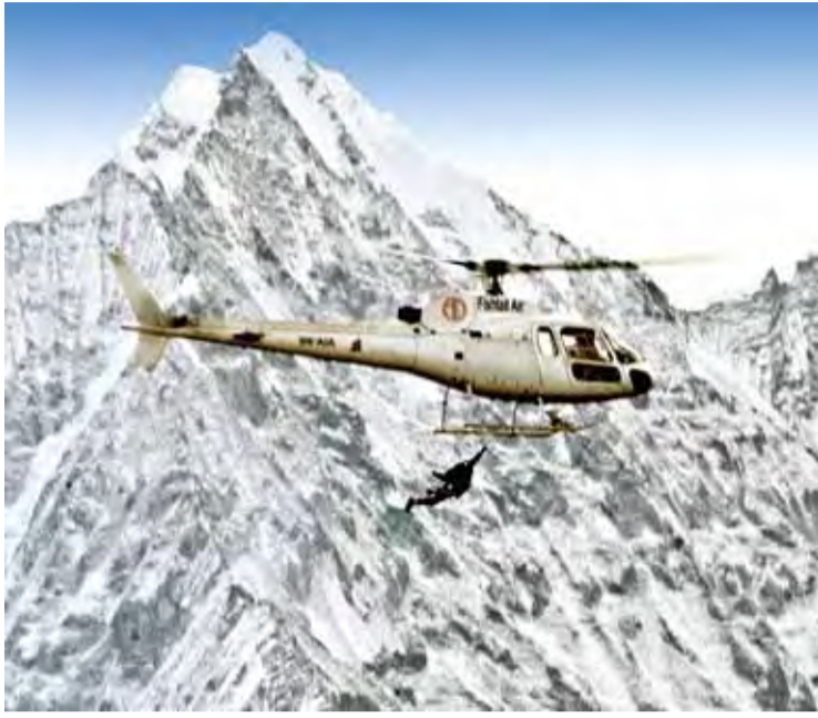
DROP ZONE: Jumping off a helicopter near Thamerku from 5,000m during a recce dive in May, and cruising over Namche.