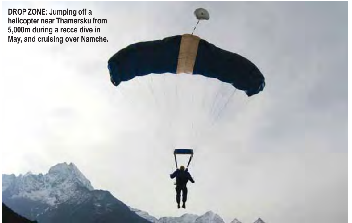
PICS: HIGH & WILD