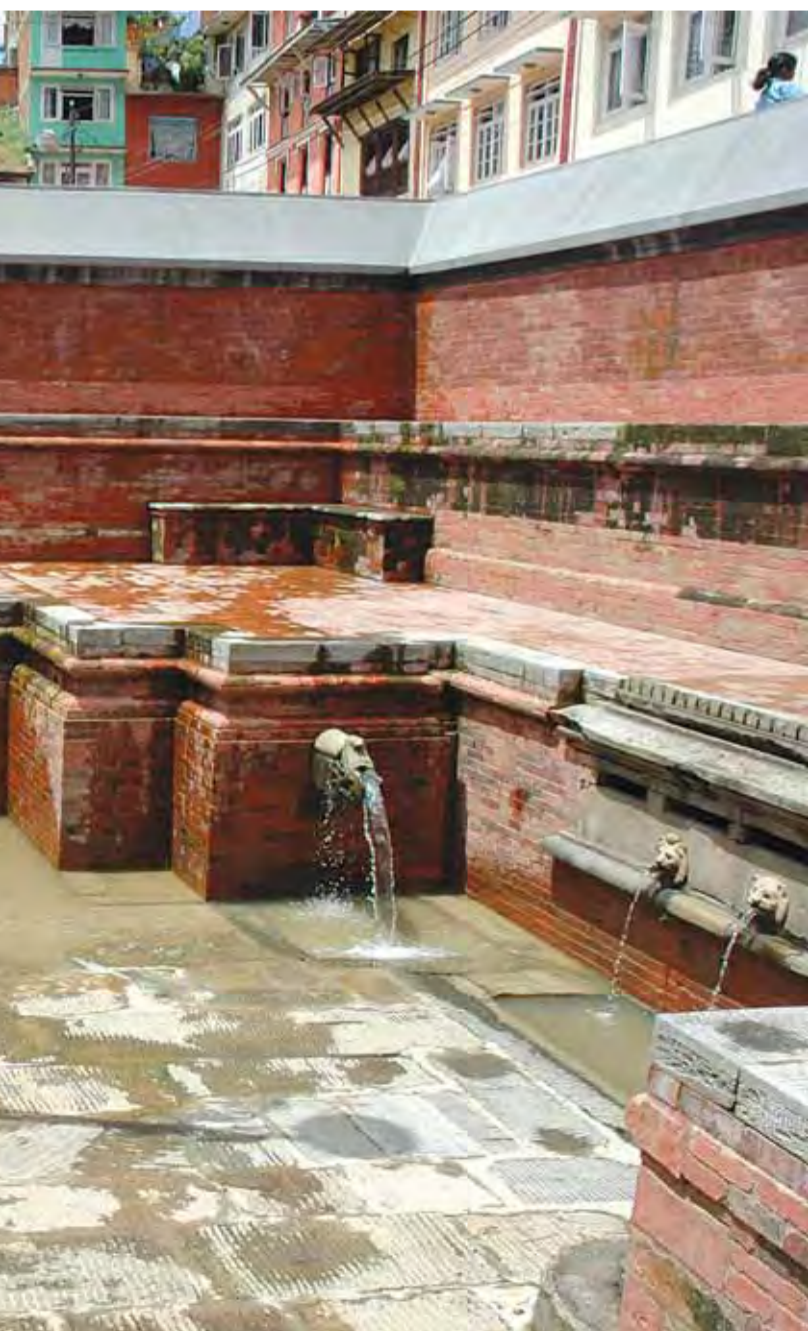
ALL PICS: NAG BAHAL HITI REHABILITATION PROJECT