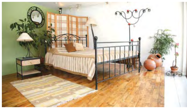
Akarshan Interiors, Kopundole

Fusion says it sells “furniture of the future”. The straight-edged and elegant European styles are striking to look at, easy to deliver and assemble. The speciality here is office furniture, mostly made in Nepal from pre-laminated particle board. Home furniture is imported. With a new range of fabulous new pieces sold with lengthy warranties, Fusion claims a 95 per cent repeat order rate.