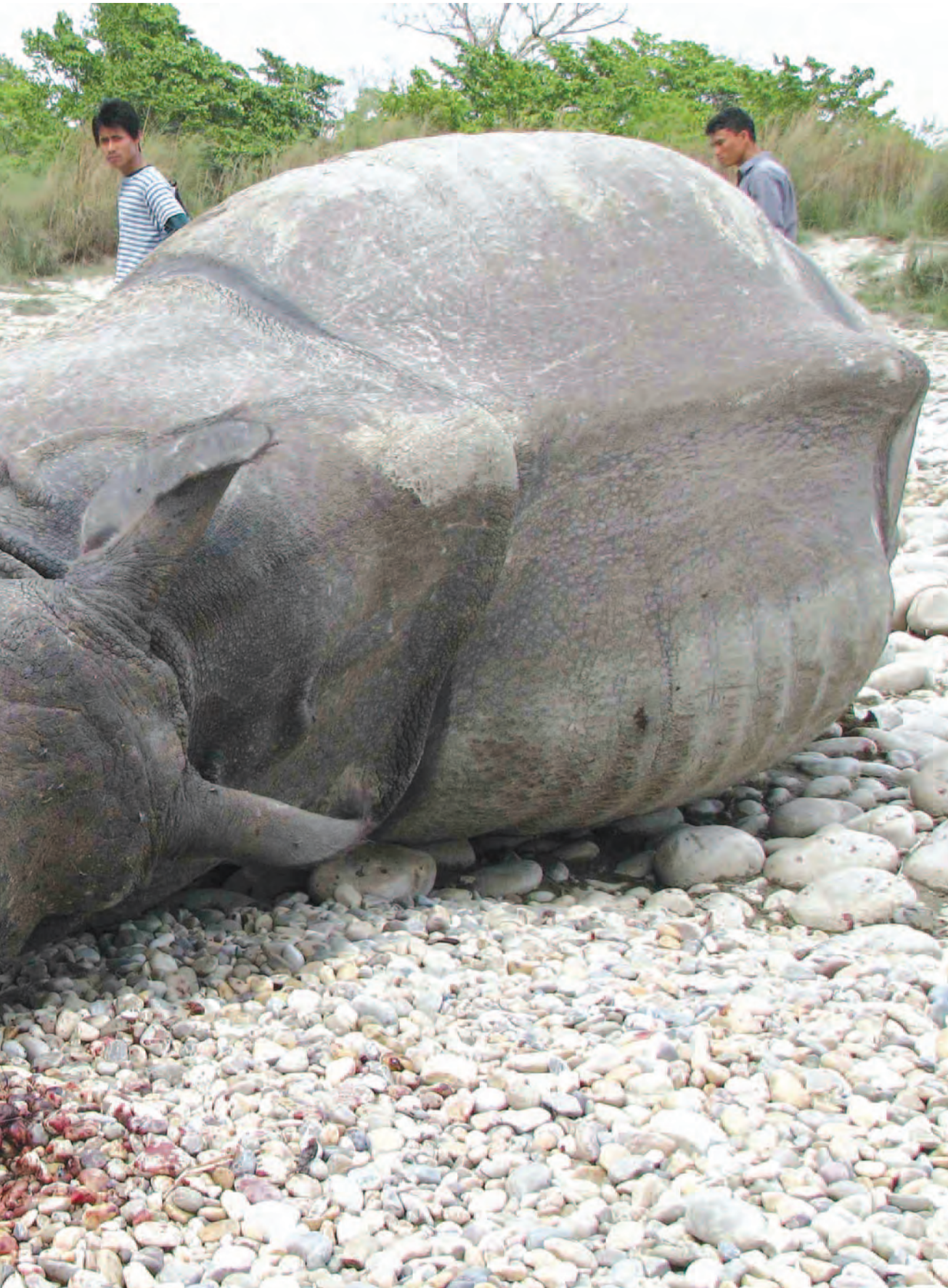
PIGS: RAMESWOR BOHARA

OUTRAGE: A male rhino with its horn hacked off found in Bardiya National Park in April, and (below) bullock carts full of concealed timber head off into India at the border in Banke.