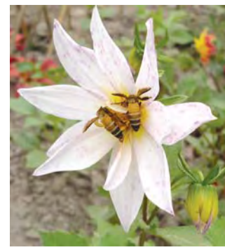
SURENDRA RAJ JOSHI

Residue Control Plan, we should still have provided some documentation proving our honey is safe. Our main market, Norway, was wiped out," says Ganesh Dawadi of Department of Food Technology and Quality Control.