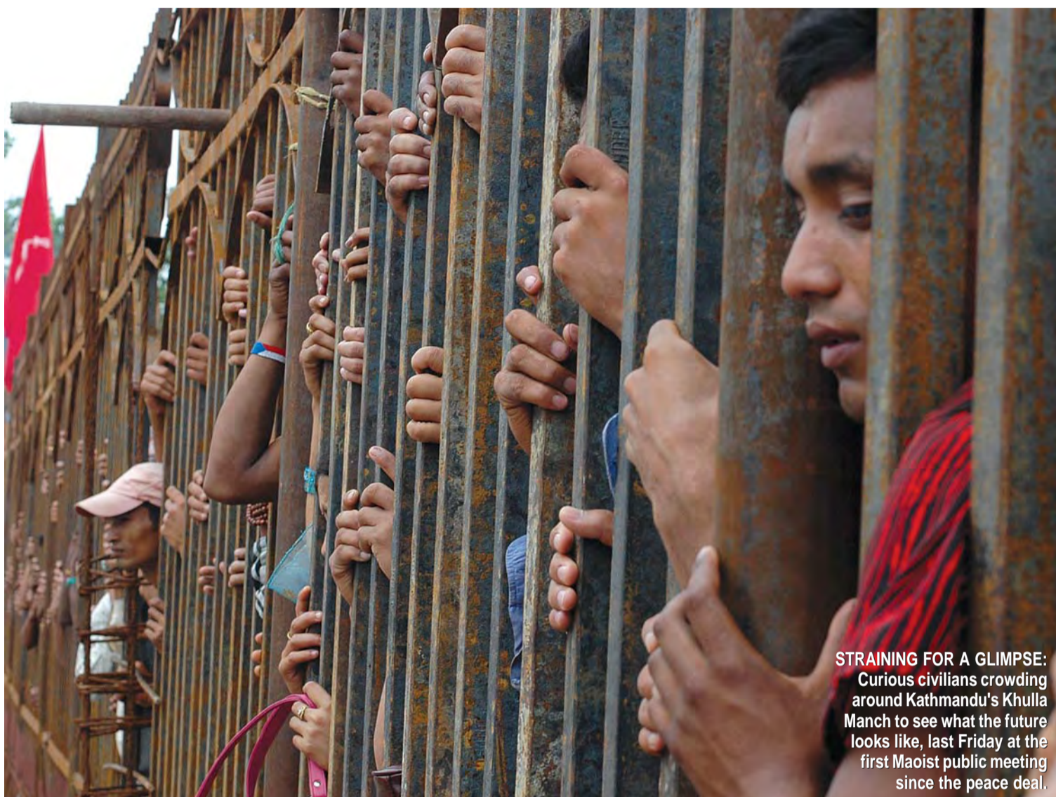
STRAINING FOR A GLIMPSE: Curious civilians crowding around Kathmandu's Khulla Manch to see what the future looks like, last Friday at the first Maoist public meeting since the peace deal.