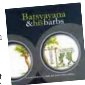
Batsyayana & his barbs A Cartoonists's Take on Post-1990 Nepal FinePrint, Kathmandu 2006 148 pages Rs 700

Looking back at the April Uprising and analysing media coverage of the last days of royal rule, what seems to have played a bigger role than bricks and barricades was the power of ridicule.