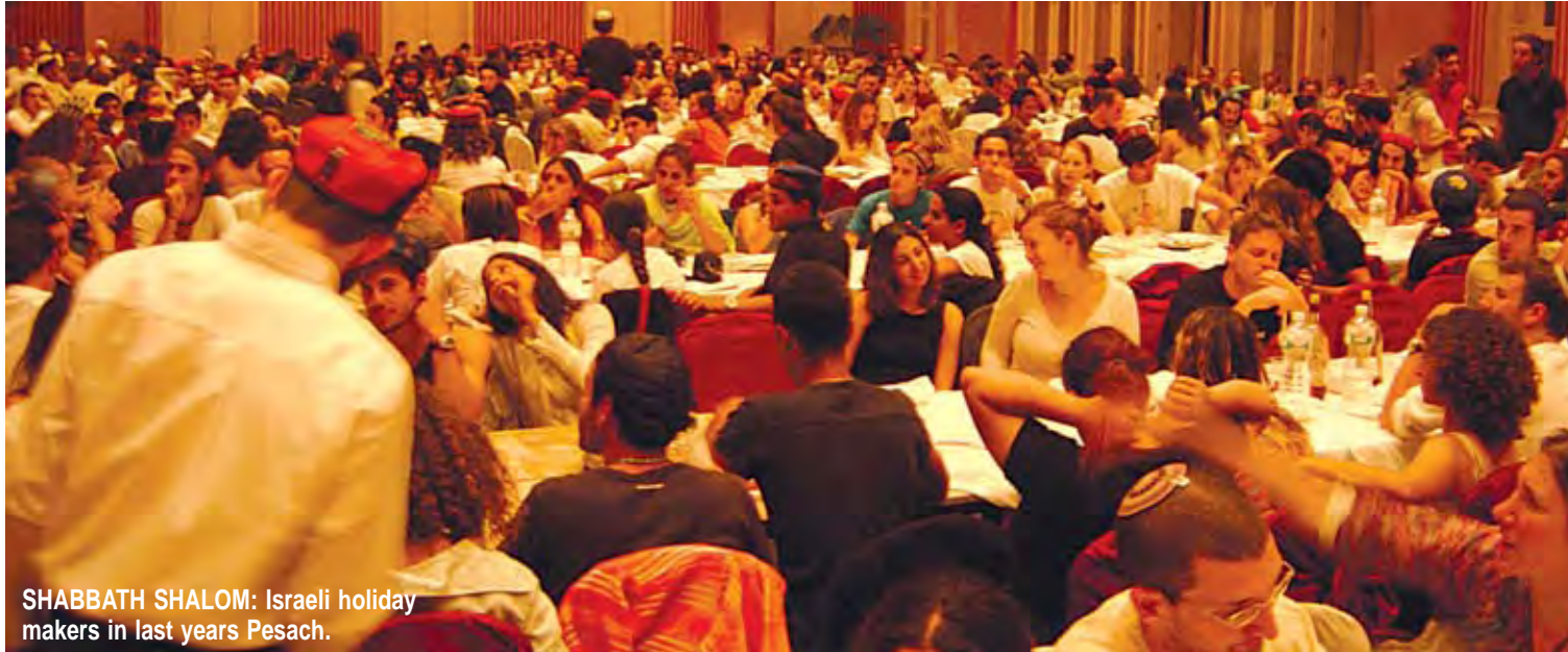
SHABBATH SHALOM: Israeli holiday makers in last years Pesach.

Nepal hosts more people for the Jewish festival than any other Asian country